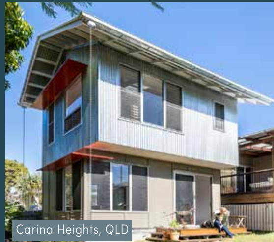
Carina Heights, QLD