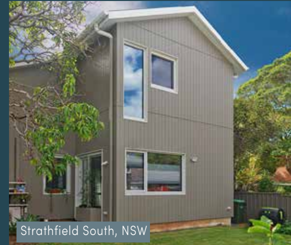
Strathfield South, NSW