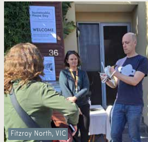
Fitzroy North, VIC

"First time hosts and overall had a great day and great experience – a credit to SHD organisation and planning. Made it very easy."