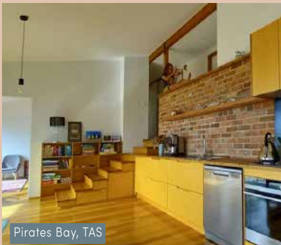
Pirates Bay, TAS