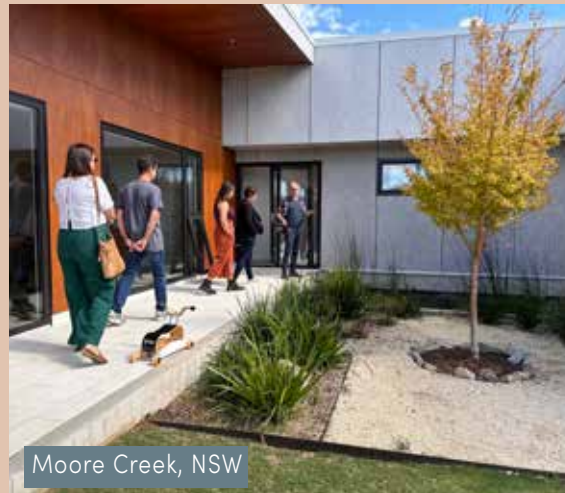
Moore Creek, NSW