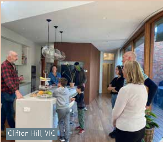
Clifton Hill, VIC