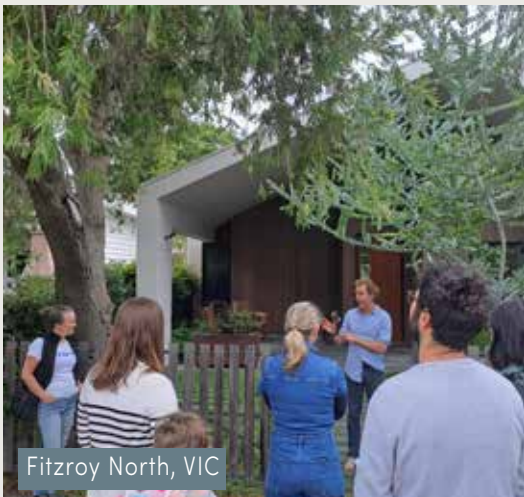
Fitzroy North, VIC

"It was wonderful to have so many curious and passionate people attend the Sustainable House Day Tour this year! I enjoyed ... the wonderful visitors who showed such a genuine interest."