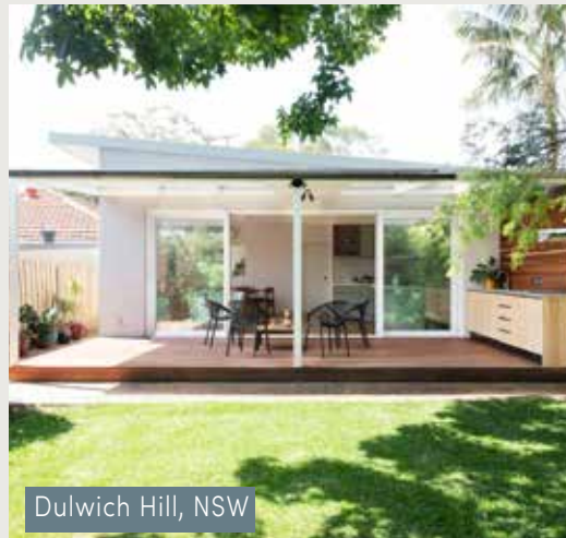
Dulwich Hill, NSW

"I think the day went really well, the website and listing were great and I think many people were inspired and will feel motivated to work to retrofit their own homes."