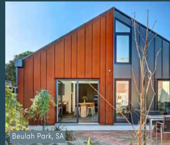
Beulah Park, SA