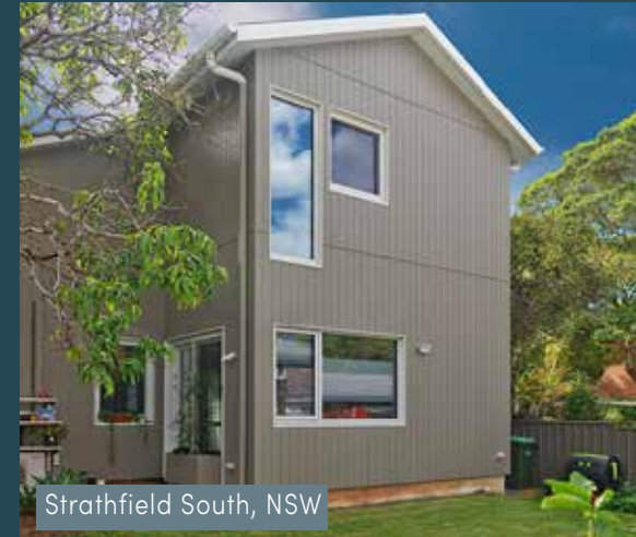
Strathfield South, NSW