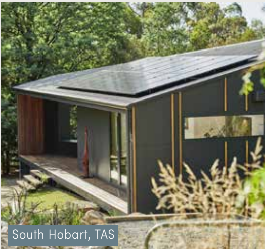
South Hobart, TAS