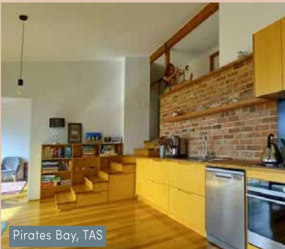
Pirates Bay, TAS