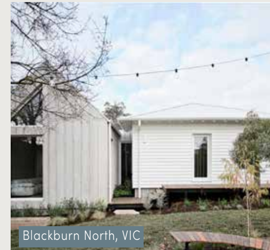
Blackburn North, VIC

“It was extremely affirming after all the research, hard work, blood, sweat and tears that went into our home to hear so many lovely things from visitors who understand better than most about your vision and the result. So many people were very outwardly thankful in a very genuine way and it just left us feeling grateful that the world might improve slightly from our small act.”