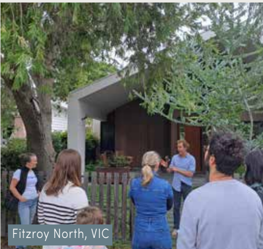
Fitzroy North, VIC

“It was wonderful to have so many curious and passionate people attend the Sustainable House Day Tour this year! I enjoyed ... the wonderful visitors who showed such a genuine interest.”