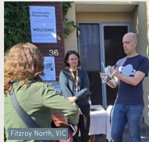
Fitzroy North, VIC

“First time hosts and overall had a great day and great experience – a credit to SHD organisation and planning. Made it very easy.”