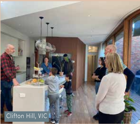
Clifton Hill, VIC