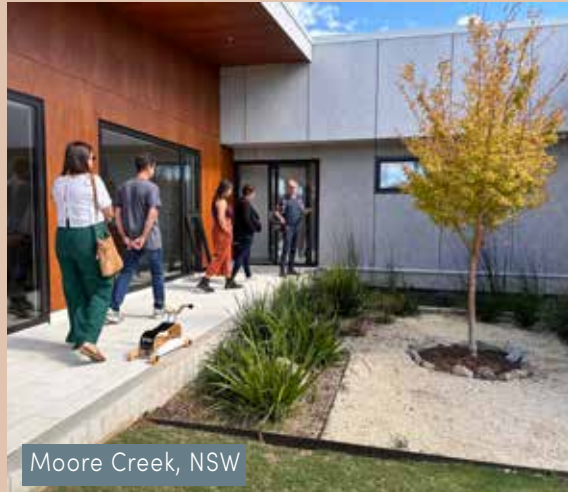
Moore Creek, NSW