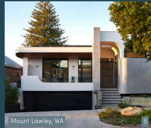
Mount Lawley, WA