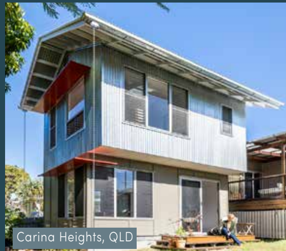
Carina Heights, QLD