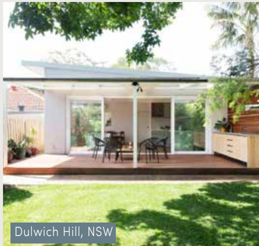
Dulwich Hill, NSW

“I think the day went really well, the website and listing were great and I think many people were inspired and will feel motivated to work to retrofit their own homes.”